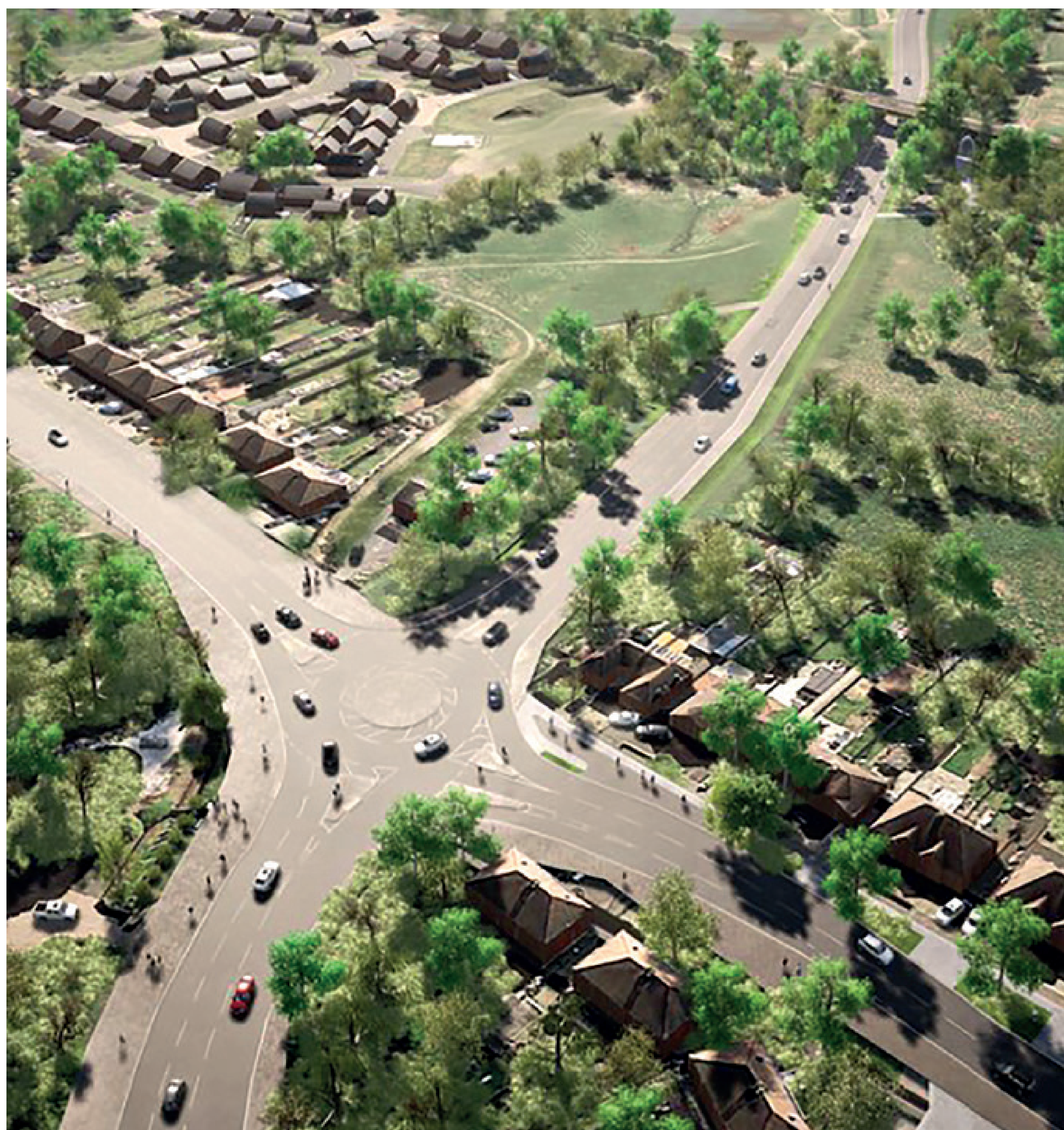
Artist's impression of the new Link Road looking southwards from the A511.

Due to the scale of works proposed at this location, this element of the project will require planning permission and the project team are in the process of preparing the relevant material to submit a planning application in early 2022.