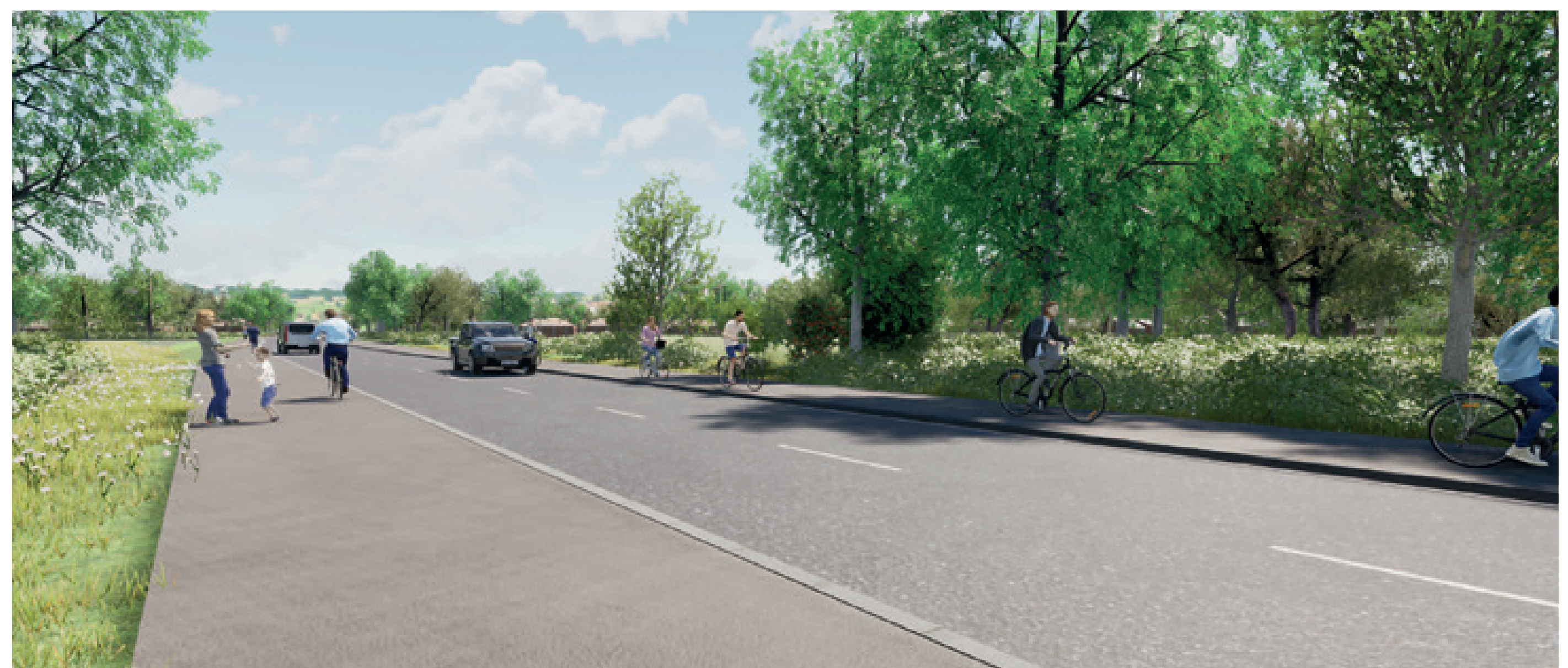
Artist's impression of the new Link Road looking north towards the A511 and Coalville.

Leicestershire County Council are continuing to work through the DfT's funding process and on the basis the scheme continues to represent good value for money and secures the necessary funding from the DfT, and subject to the necessary Cabinet approvals, we will look to commence construction in 2024.