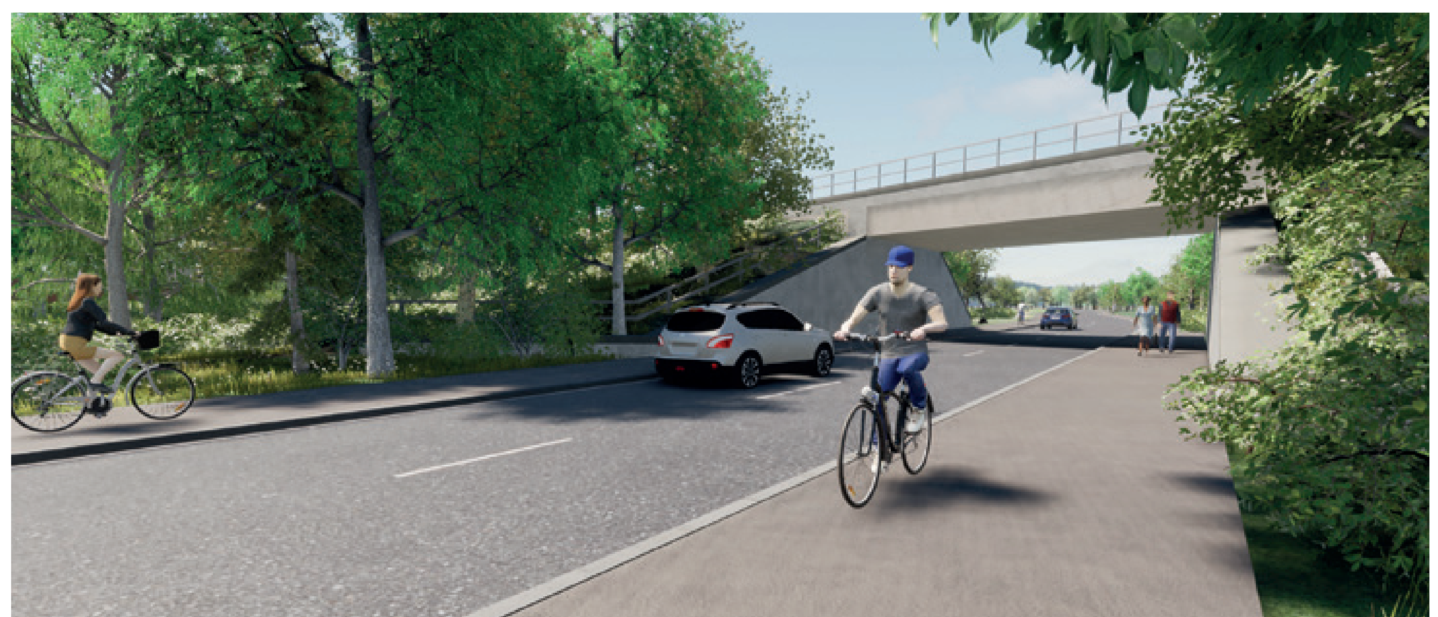
Artist's impression of the new Link Road looking south towards the railway.